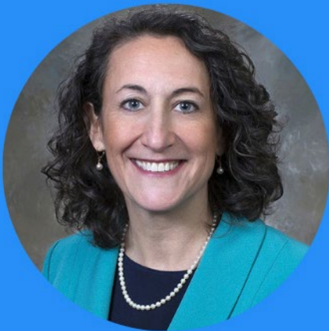
Secretary Kathy Boockvar Department of State

This Thursday night, October 1, at 6:00 pm, we're hosting a town hall conversation about the upcoming election with Secretary of State Kathy Boockvar. We'll discuss changes to voting and answer questions that you have about the November General Election. Sign up to participate by Zoom at www.SenatorLindseyWilliams.com/Vote or stream live at